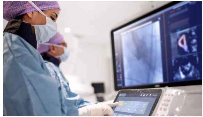
Control of Philips Hemo on Touch Screen Module