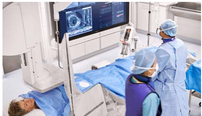
Confidently used by all staff members with minimal training