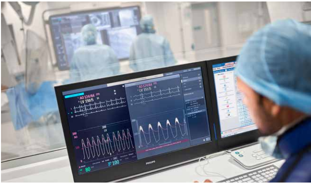
Improved communication between control room and exam room