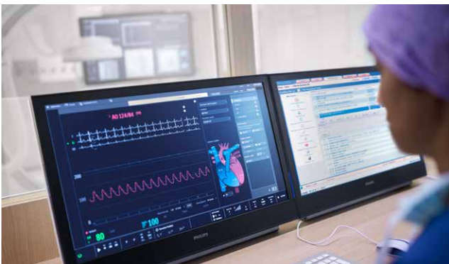
Graphical interaction and user guidance through the procedure