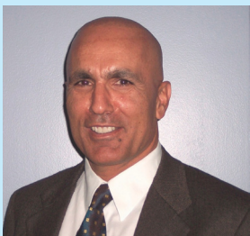
Author: Professor Sabee Molloi.

The positive association between a qualitative classification of mammographic breast density and breast cancer risk was first reported in 1976, and has since been confirmed by many studies. 1,3-13 However, qualitative methods of assessment aren't reproducible, because different reviewers can perceive density differently. Thus, several quantitative methods have been developed. The first of these entailed reviewing 2D projection images of compressed breasts, and segmenting the breasts according to different X-ray attenuation properties. 14,15,16 This method required each pixel in the image to be classified as either purely adipose or purely fibroglandular tissue, making the measurements inaccurate. In addition, because the measurement relied on a 2D projection, it didn't take into account variations in breast thickness.