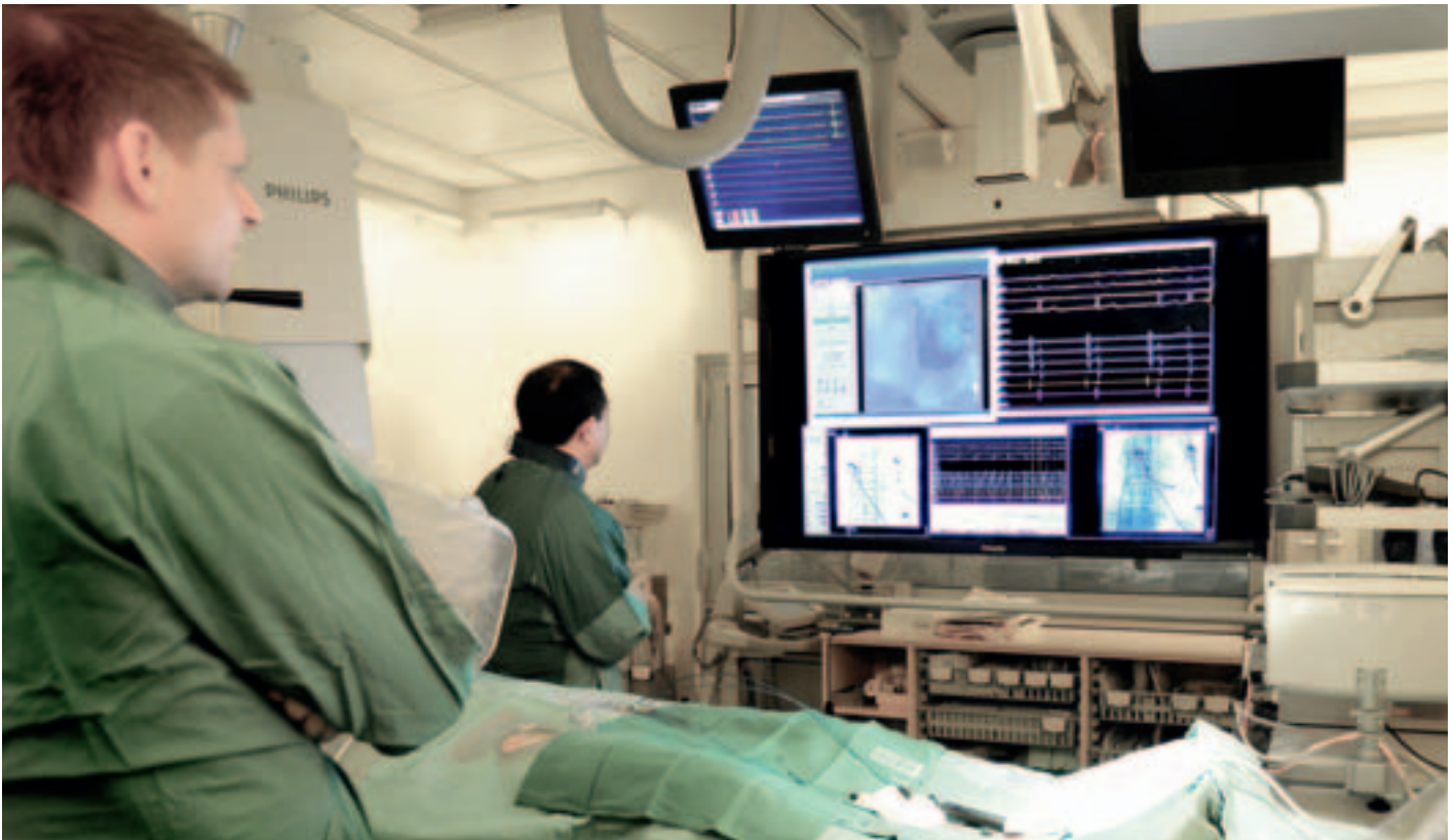
The enlarged images on the XL screen improve procedural comfort

One might think that enlarging images would mean a reduction in image quality, with images becoming more blurred or coarse-grained. This is not the case, says Goetze. On a day-to-day basis, he never has to zoom out of an enlarged image in order to increase image quality.