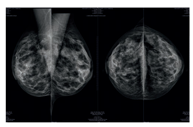
Vertical tissue alignment enhances the symmetry between left and right breasts based on the glandular tissue, not just breast curvature.