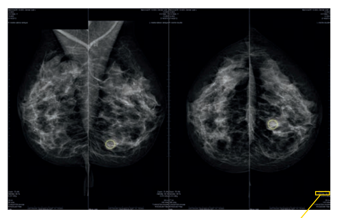
Mammography CAD markers and breast density information, if available, can be toggled on and off to signal the need for a closer inspection.