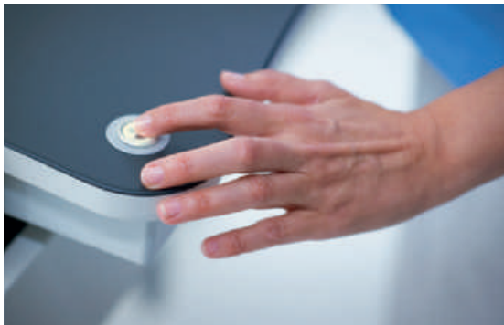
Light-touch Exposure buttons on each side of the acquisition workstation.

An additional MicroDose system feature is the Exposure foot switch option, which further helps to reduce this risk.