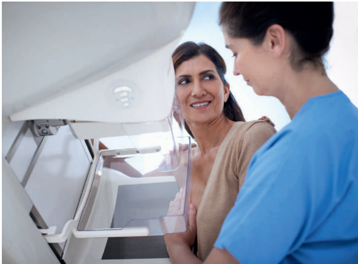
Easy positioning of the breast.

The positioning light comes on automatically when the paddle compression starts, which saves a reaching and pressing action. The high-edge compression paddle provides an additional advantage because it helps keep the contralateral breast out of the radiation beam without assistance from the patient.