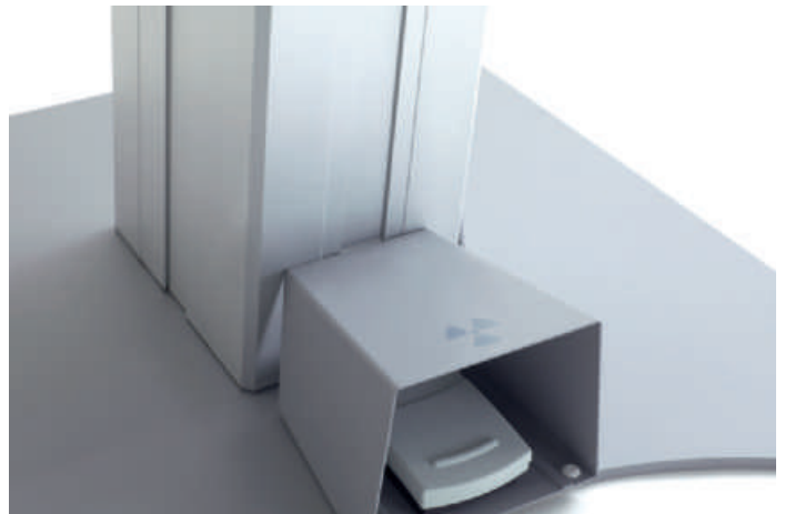
Foot switch for X-ray exposure.