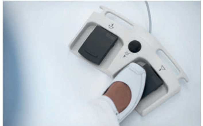
Motorized compression foot pedals and Compression done foot switch.

Alternatively, the radiographer can use the Exposure foot switch. This foot switch is particularly beneficial to screening radiographers, as it can be used to negate the need for a hand-initiated exposure process. The task of breast screening is quite intensive on the radiographer’s hands and arms, so this ability to move a function to foot operation is beneficial.