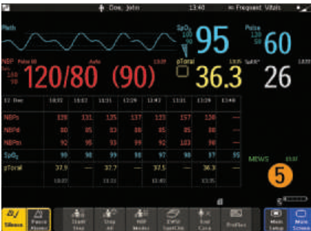
Exceptional IntelliVue measurement accuracy and trending capability.

PG Dip Echo Director of Intensive Care Research, Staff Specialist in Intensive Care Department of Intensive Care Austin Hospital, Heidelberg, Vic. 3084 Australia