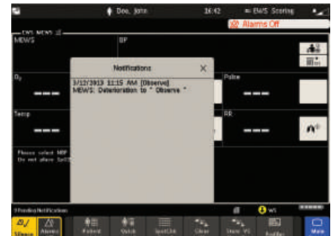
Centralized EWS workflow and notification via IntelliVue Guardian Solution.